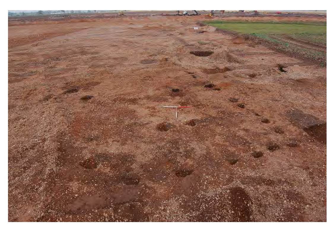
Plate 1 Structure 3 Possible Roman building, with enclosure ditches to right, facing north