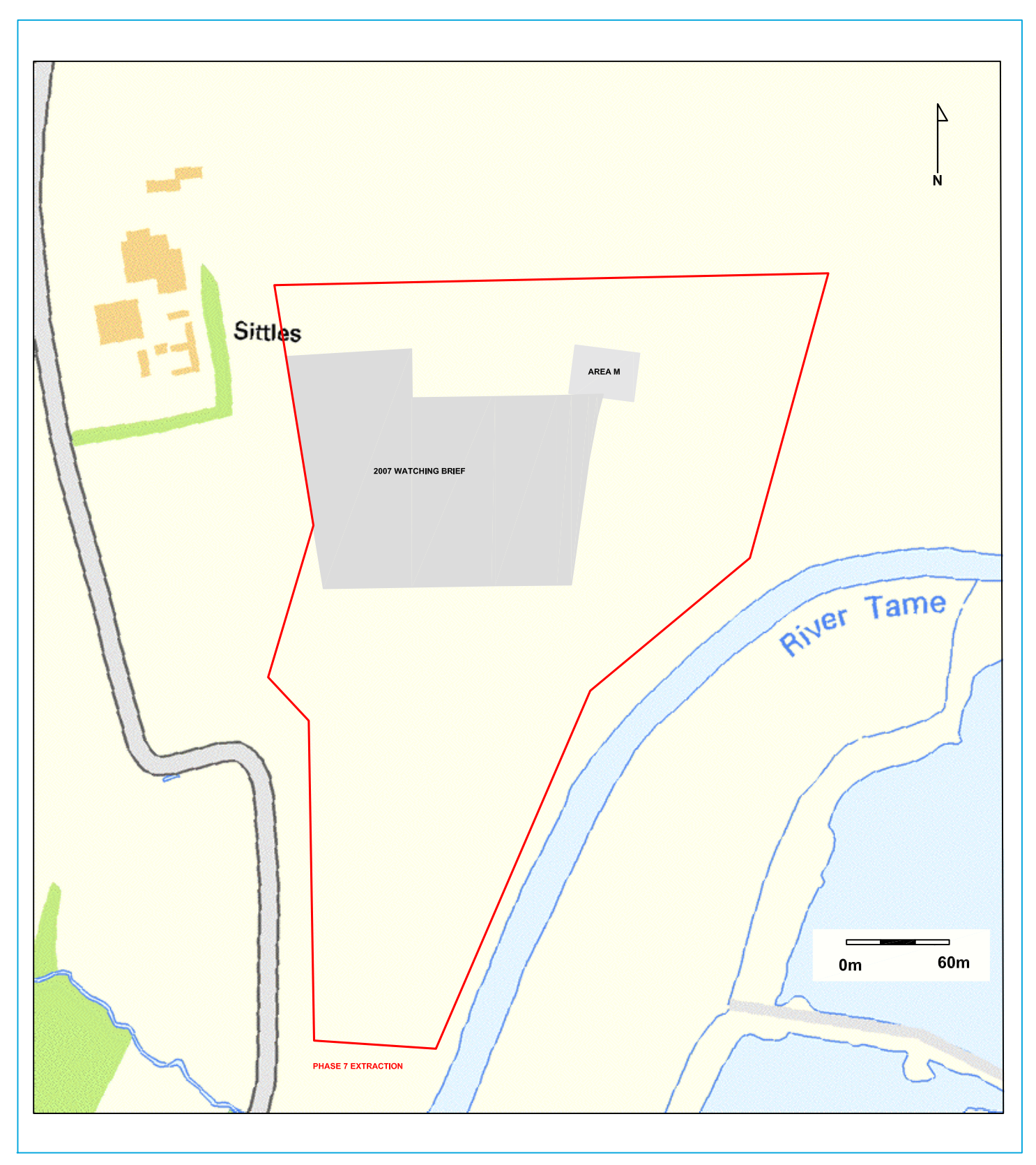
Watching brief location within the Phase 7 boundary of Whitemoor Haye quarry