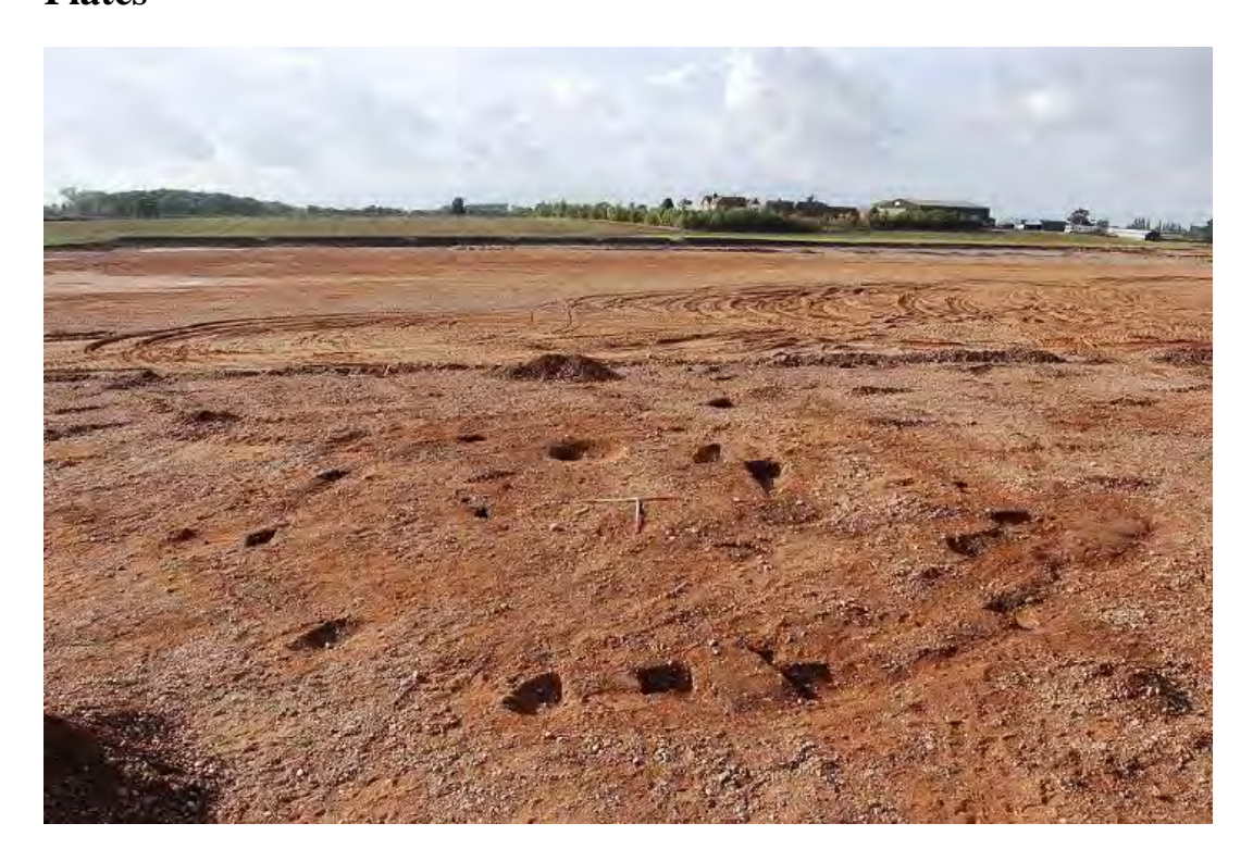
Plate 1 Structure 1 Roundhouse, facing east